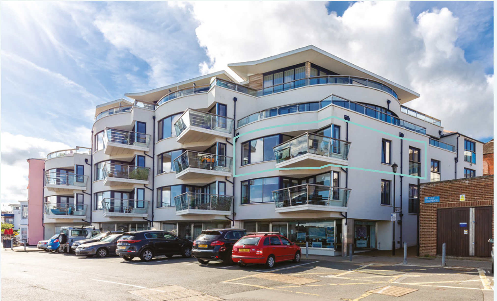
Apartment 12, Number One The Parade, Cowes, Isle of Wight